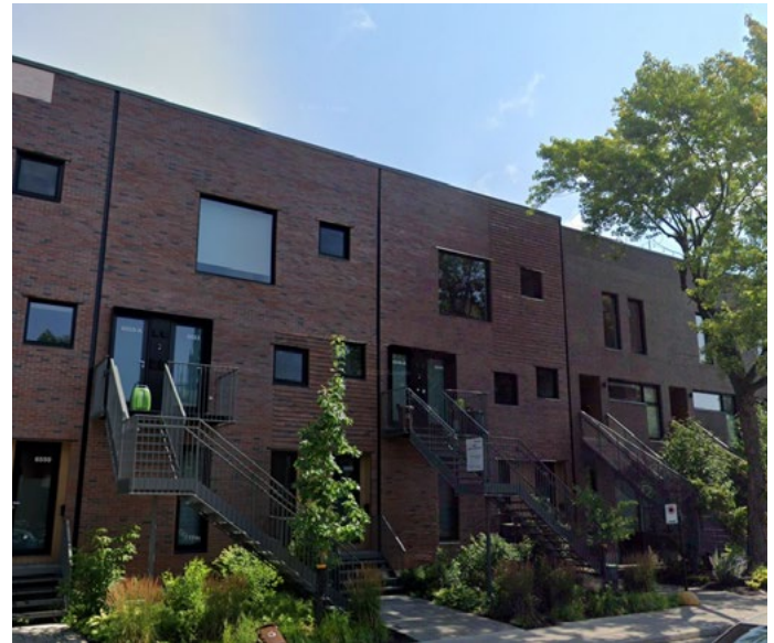
Triplexes with external front stairs, built in 2019, near a metro station in the Rosemont neighbourhood.