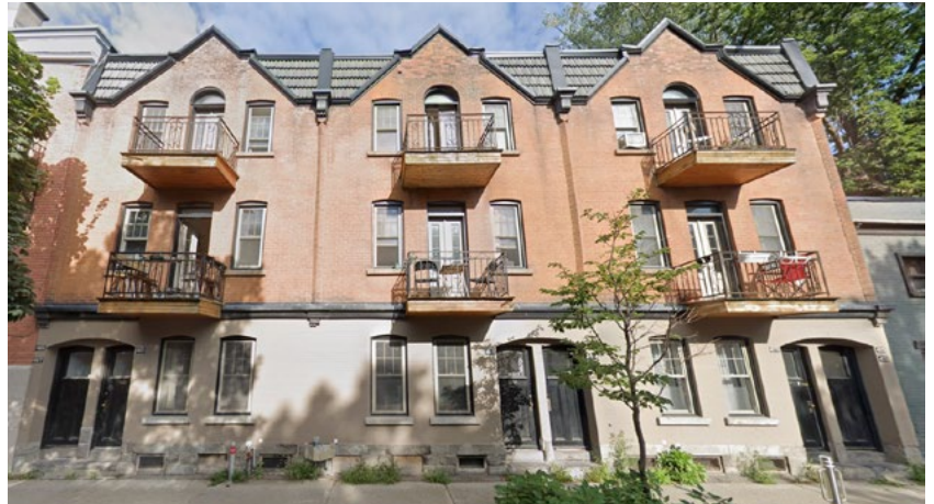
Triplices with internal stairs, built around 1885 in the Plateau Mont-Royal neighbourhood.

This regulatory framework persisted into the 20th C, allowing the plex form to flourish as Montreal's population of industrial workers boomed. However, in 1948, the City adopted a new comprehensive building code that barred curving external staircases. This led to the near disappearance of the classic Montreal triplex and its variants in favour of the three and four storey “walk-up” featuring a common outside entrance with one single street address, leading to a common inside staircase giving access to a number of flats. In the context of a major push to create more affordable housing, the City of Montreal repealed the prohibition on curving external staircases in 1978, allowing them with certain restrictions.