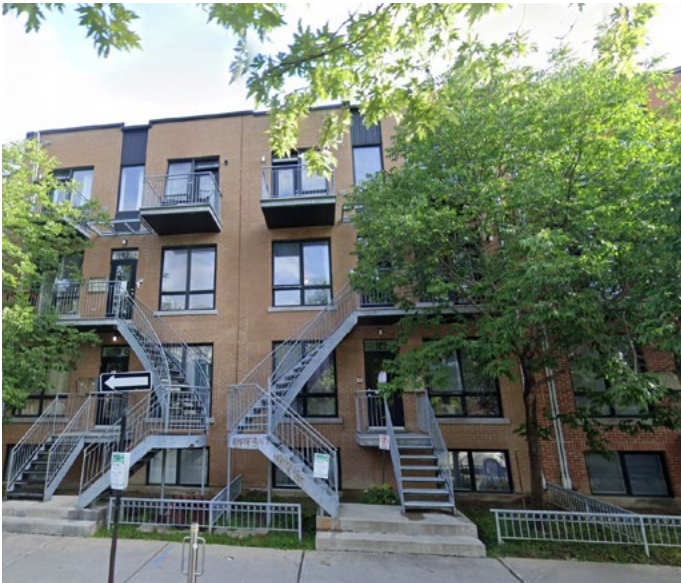
Rental multiplex built 2010, with external front staircases in the Plateau Mont-Royal neighbourhood.

Meanwhile, the gentrification of the historically working-class districts of Montreal proceeded and a new appreciation for the traditional plex form with its local authenticity and individual entrances emerged. In response, the City continued to evolve the regulatory framework. Consolidated in 2023 under bylaw 11-018, exemptions from the NBC restore the legality of tightly curving front stairs, as long as they serve no more than two units per floor and rise no higher than the second floor and eliminate the need for fire separation distances between windows and exit stairs. With the changing regulatory framework, architects are once again experimenting with external staircase designs in the historic quarters of Montreal.