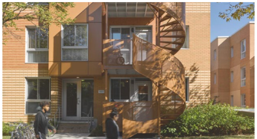
Triplices with internal stairs, built around 1885 in the Plateau Mont-Royal neighbourhood.